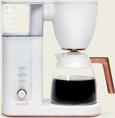
Specialty Drip Coffee Maker with Glass Carafe C7CDABS4RW3 FOUR SCA CERTIFIED BREW MODES