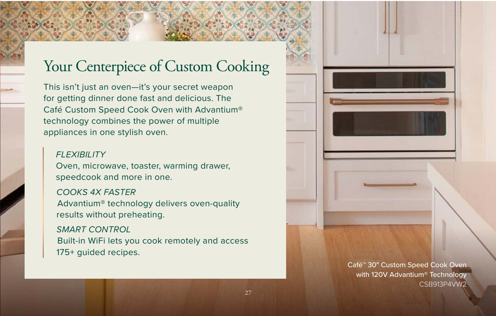
Café™ 30" Custom Speed Cook Oven with 120V Advantium® Technology CSB913P4VW2

Built-in WiFi lets you cook remotely and access 175+ guided recipes.