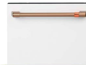
Smart Single Drawer Dishwasher CDD220P2WS1