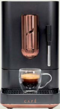
AFFETTO Automatic Espresso Machine + Frother C7CEBBS3RD3 EXTRA STYLE, EXTRA CAFFEINE