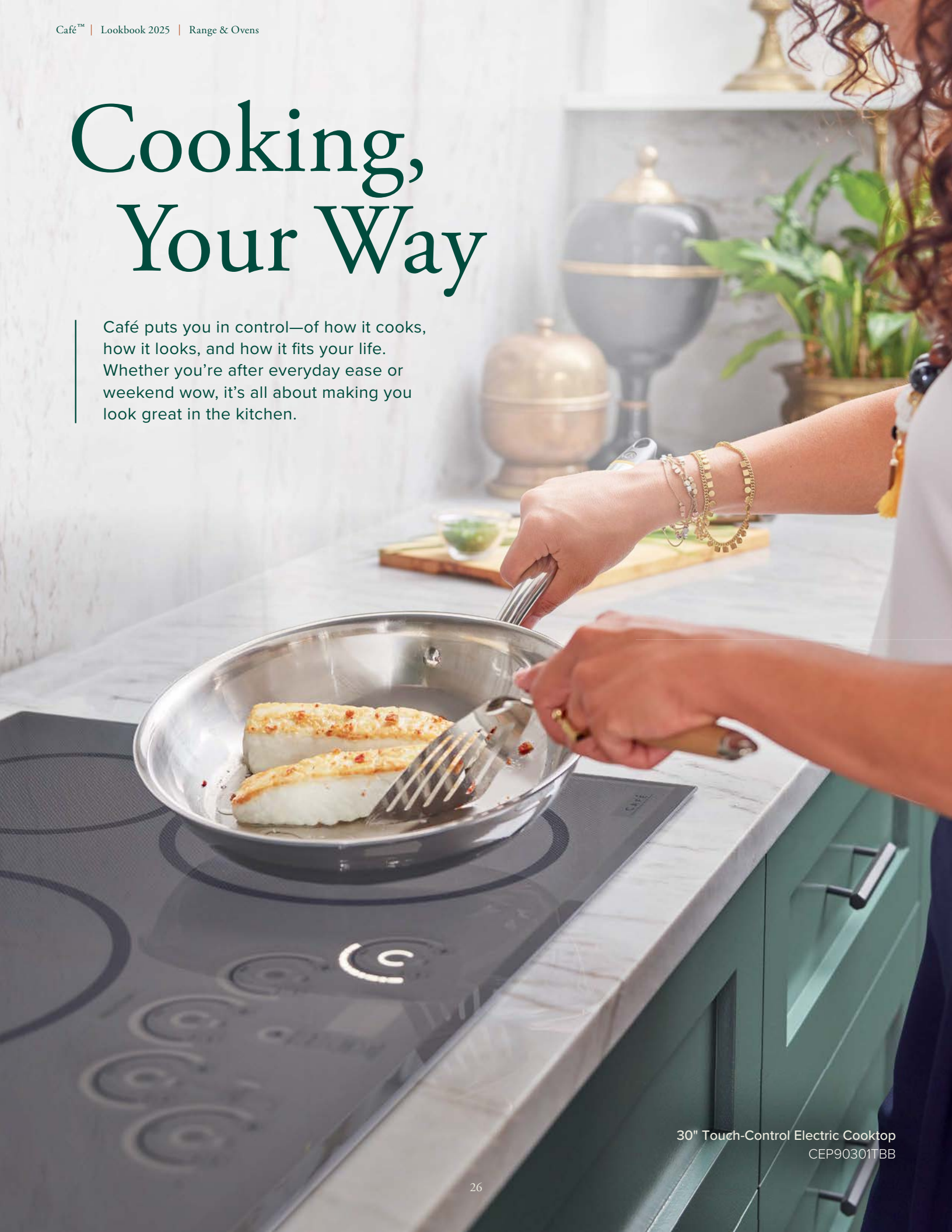
30" Touch-Control Electric Cooktop CEP90301TBB

Café puts you in control—of how it cooks, how it looks, and how it fits your life. Whether you're after everyday ease or weekend wow, it's all about making you look great in the kitchen.