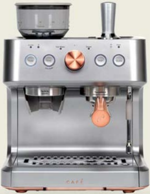
BELLISSIMO Semi Automatic Espresso Machine + Frother C7CESAS2RS3 STATEMENT DRINKS MADE BY YOU