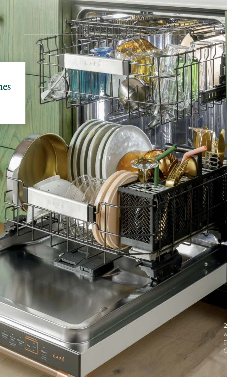
24" CustomFit Dishwasher with UltraWash and Dual-Convection UltraDry CDT888P4VW2