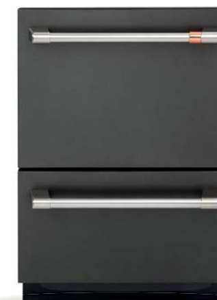
24" Double Drawer Dishwasher CDD420P3TD1