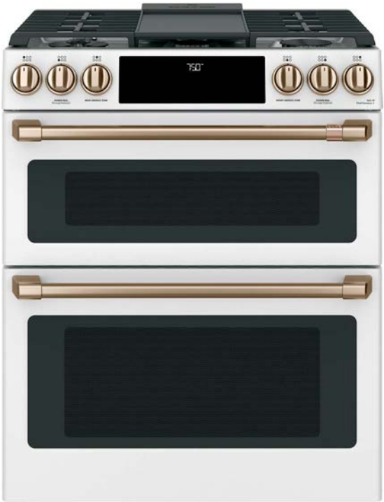
30" Smart Slide-In, Front-Control Gas Double-Oven Range with Convection CGS750P4MW2