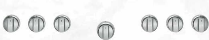
CAFÉ BRUSHED STAINLESS

Café continues to set trends with curated finishes inspired by the runway. Now Café joins design forces with iconic brand KOHLER to bring complementary hardware finishes to the kitchen space, so you can reflect your unique style. Together these brands are bold thought leaders in design that power self-expression.