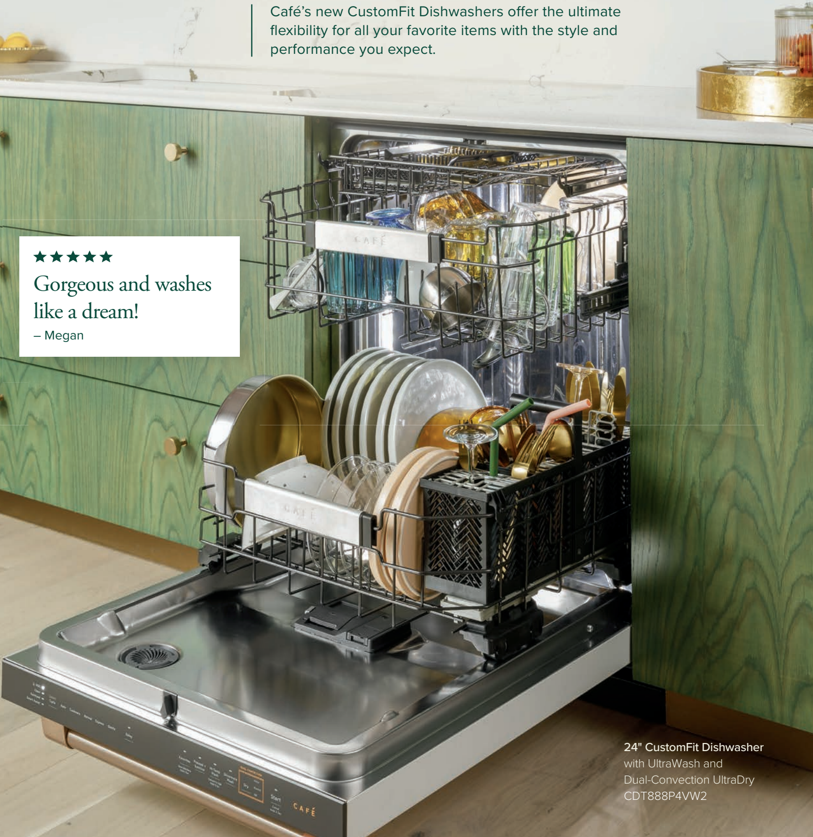
24" CustomFit Dishwasher with UltraWash and Dual-Convection UltraDry CDT888P4VW2