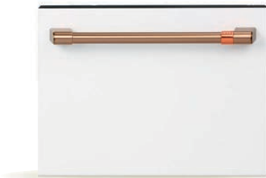
Smart Single Drawer Dishwasher CDD220P2WS1