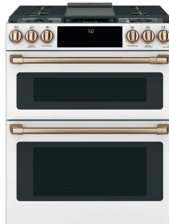
30" Smart Slide-In, Front-Control Gas Double-Oven Range with Convection CGS750P4MW2

30" ENERGY STAR® Touch Control Induction Cooktop CHP90301TBB