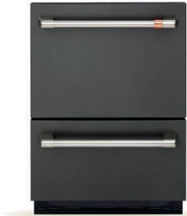
24" Double Drawer Dishwasher CDD420P3TD1