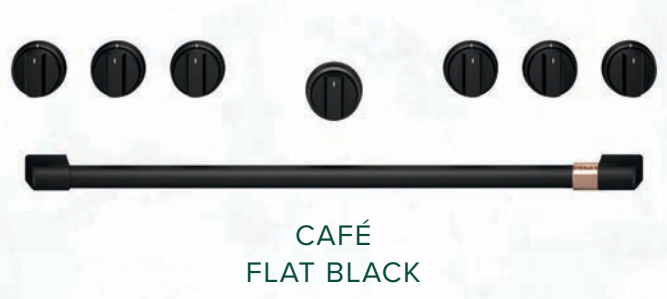
CAFÉ FLAT BLACK