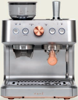
BELLISSIMO Semi Automatic Espresso Machine + Frother C7CESAS2RS3 STATEMENT DRINKS MADE BY YOU