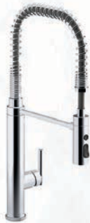
KOHLER PURIST SEMI-PROFESSIONAL KITCHEN FAUCET VIBRANT STAINLESS