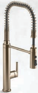
KOHLER VIBRANT KITCHEN FAUCET BRUSHED BRONZE