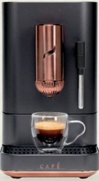
AFFETTO Automatic Espresso Machine + Frother C7CEBBS3RD3 EXTRA STYLE, EXTRA CAFFEINE