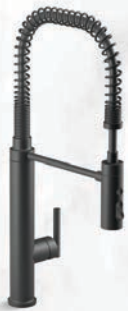
KOHLER CRUE KITCHEN FAUCET MATTE BLACK