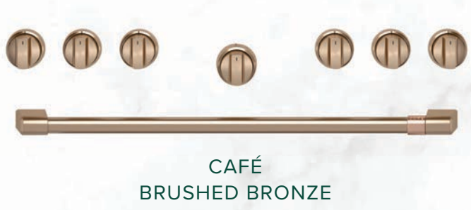
CAFÉ BRUSHED BRONZE