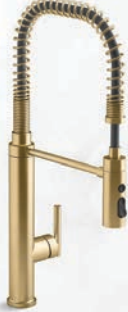
KOHLER TONE KITCHEN FAUCET VIBRANT BRUSHED MODERN BRASS