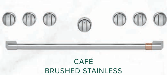
CAFÉ BRUSHED STAINLESS

Café continues to set trends with curated finishes inspired by the runway. Now Café joins design forces with iconic brand KOHLER to bring complementary hardware finishes to the kitchen space, so you can reflect your unique style. Together these brands are bold thought leaders in design that power self-expression.