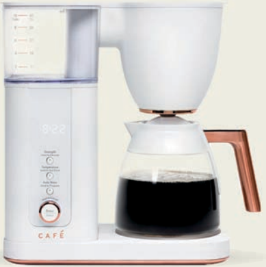
Specialty Drip Coffee Maker with Glass Carafe C7CDABS4RW3 FOUR SCA CERTIFIED BREW MODES